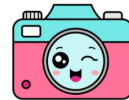
PHOTO SHOOT FOR DIRECTORY – there will be another photo shoot for the new BUMC directory on Wednesday, March 19 th from 10-11:00 AM in the Music Suite. Active visitors are welcome! Contact the church office if you have any questions (843) 757-3351.

To reserve your tickets, visit https://www.tix.com/ticket-sales/hiltonheadchoralsociety/4914