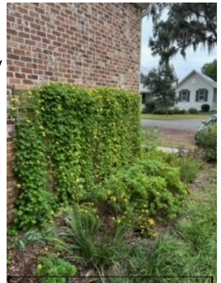
Our Black-eyed Susan is still showing God's beauty in the Sunshine Garden.