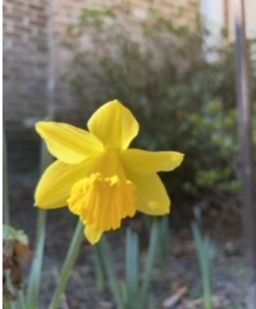
The first Daffodil announcing spring.

“And the Lord God took the man and put him into the Garden of Eden to dress it and keep it” (Gen. 2:15)