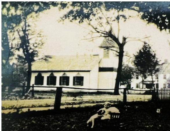
Methodist church before the storm looking at the church from the Seven Oakes House near the corner of Calhoun & Bridge Streets

Methodist churches on our current location (there were three of them) have taken on different looks and it is interesting to find pictures of them taken at various times. We were lucky to find two different looks at the first Methodist church built on our current site before and after a hurricane knocked down a big oak tree in 1940. The storm is referred to as the 40's Storm as the term hurricane hadn't been used at that time.