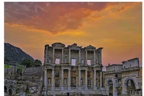
Sunset at Ephesus

Next, have you ever wondered what it would be like to follow in the Footsteps of Paul? In March of 2025, we will travel to Greece and Turkey to see the places where Paul preached and started churches. We will grow in faith and fellowship as we explore cities like Ephesus, Philippi, Thessalonica and Athens. We will even spend time in Santorini! For more information, please join us on Monday, March 18 at 4 PM in the sanctuary of Bluffton UMC. Trip dates are March 25 - April 3, 2025.