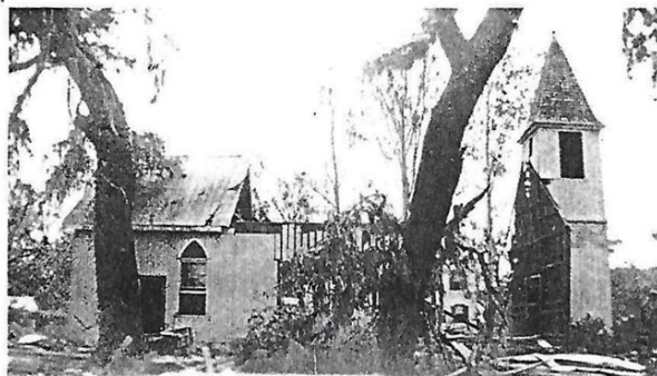
Methodist church after it was hit by a large oak tree and essentially de- stroyed in 1940.