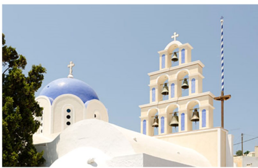
Church in Santorini

Finally, on Sunday, April 14, at 2 PM , we will spend some time talking about How We Got Here and General Conference. For an hour or so, we will spend some time seeking understanding of what brought us to this point with General Conference. We will cover the structure and steps that brought us to where we are and I will present possibilities as best they are known at that point.