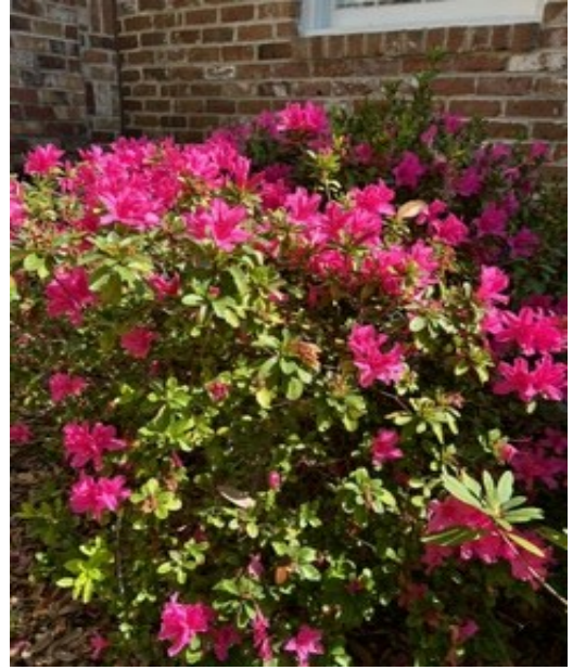
Azaleas in our Reflection Garden announcing Lent.

Now that we have all enjoyed the winter beauty of the camellias along Camellia Walk and the new one at the corner of Water Street, it's time to think about Spring! Although March is the official arbiter of spring, in the Lowcountry, the February pollen generally declares the first sign.