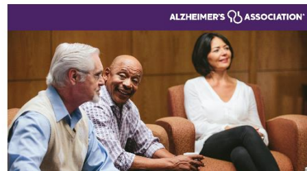
Alzheimer's & Dementia Caregiver Support Group

Love to sing? Join us next Sunday, July 14 for a special Summer Choir. Rehearsal will be Wednesday, July 10 at 6:30pm in the Sanctuary. We will sing for both the 8:30 and 11:00 services. All are invited. Hope to see you there!